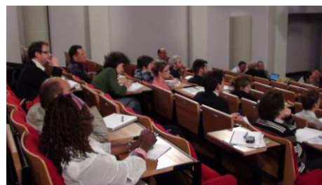
The meeting in St Omer about "Geographical information abroad" was welcomed on May 26 at the Longuenesse School of Engineers.

- and in Paris (Oct.20) : What kind of profiles and jobs within the urban agencies when working abroad ? [workshop in the framework of the FNAU 32th Annual Meeting], 31 participants, including the directors of the Moroccan urban agencies of Fes, Agadir, Meknes and Nador).